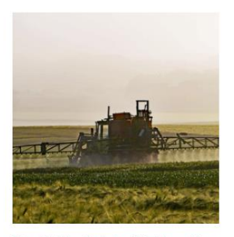
Pesticide Safety & Education

"No matter the challenge, MSUE remains committed to serving our stakeholders around the state."